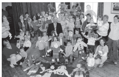
David Simpson MP visits Eden Tots in 2005